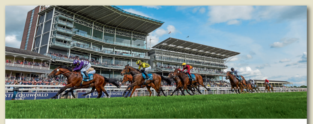
York - Top rated racecourse by National Association of Racing Staff