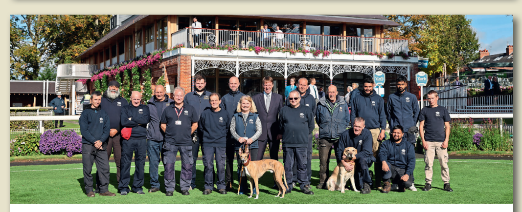
York - winners of Racecourse Association Flat Course Groundstaff of the Year 2022