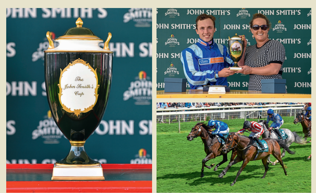
The details of the race programme are correct at time of printing however they may be changed so please visit the website, www.yorkracecourse.co.uk, or refer to the Racing Calendar.