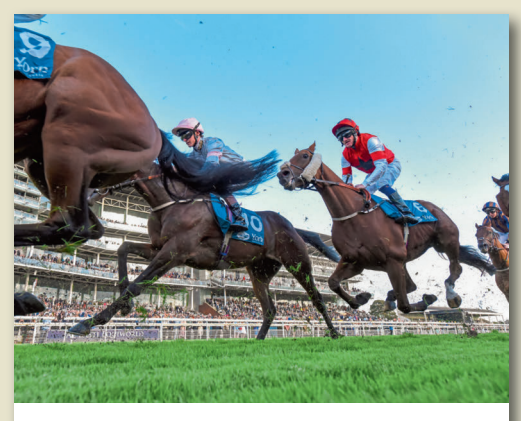
ROA Gold Standard Racecourse 2023